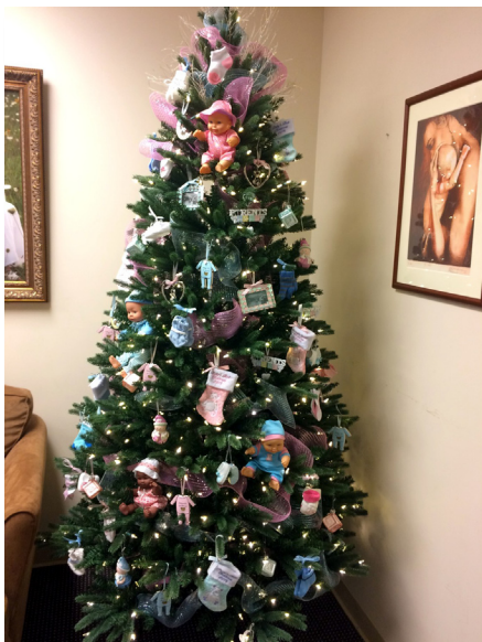
A Christmas tree decorated with blue and pink ornaments decked our office this year. Clients who picked up a layette in the month of December received an ornament that read, "Baby's First Christmas 2016".