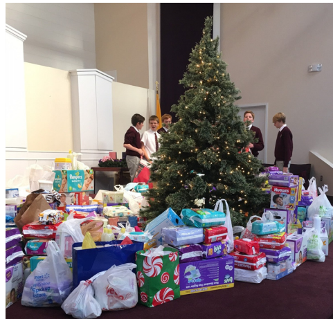
Holy Cross Academy erected a Christmas Giving Tree to benefit local charitable organizations, such as Birthright of Fredericksburg. Students from all classes brought in various baby items and placed them under the tree. We are most grateful to all the students, teachers, and staff at Holy Cross Academy for their generosity.